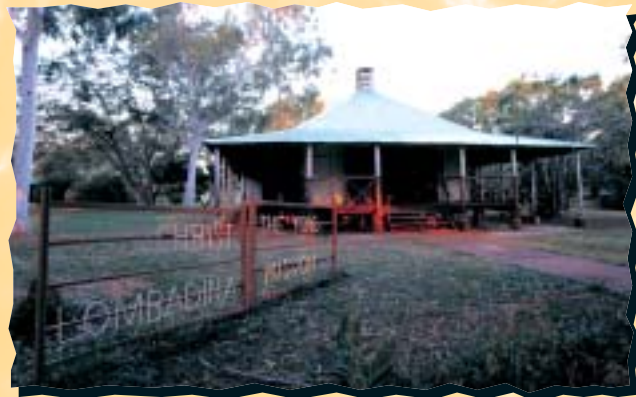
CHRIST THE KING CHURCH Lombadina. An architectural masterpiece, built from local timbers.

Stay with us in our accommodation and join one of our tours and your friendly local guide and host will help explain traditional ways, history and contemporary aspirations of this unique destination. No visit to Broome is complete without a taste of the Peninsula.